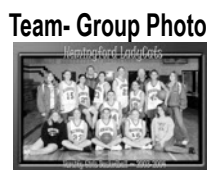
Team- Group Photo