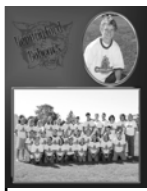
Memory Mate Composite Please specify team:

Team and individual photo included in one 8x10 print. With school and year. Add Name for $3.00